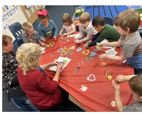
Rainbows and Prims (pink)